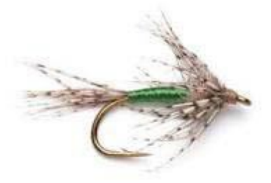
Partridge and Green