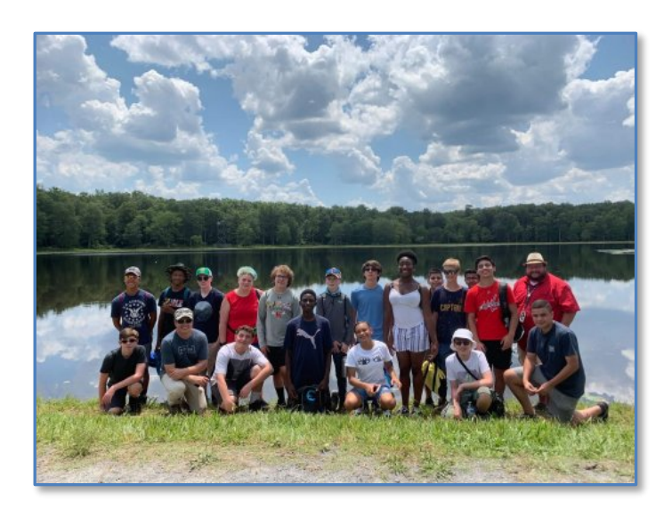
"The best fisherman I know try not to make the same mistakes over and over again; instead they strive to make new and interesting mistakes and to remember what they learned from them."

"What an incredible day at the Patuxent River Refuge Reservoir! We caught more fish than I have ever seen in one day. I lost count. Thanks to the amazing crew from PPTU for making this possible! Your knowledge, patience and willingness to go the extra mile really made the difference today. This is an experience these kids will never forget. I know we just made several future fishermen and women. Thanks again!"