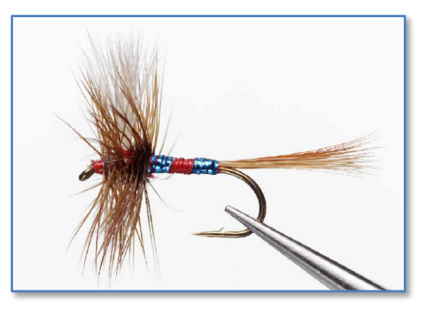
"The Patriot" ~ Dry Fly by Charlie Meck

https://www.legacy.com/obituaries/centredaily/obituary.aspx?n=charles-r-meck&pid=190272030&fhid=15341