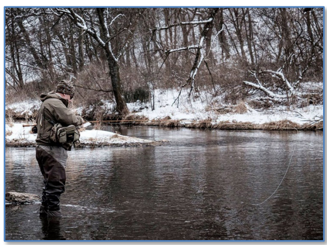
Tone Down - Be Dull (Seriously): As a rule of thumb, winter demands duller, darker colors more

Go smaller with your Strike Indicator: Never throw big, gaudy strike indicator in the winter. Instead, try using small pieces of yarn, pinch-on foam, or when the water is really low and slow, use a dry fly such as parachute Adams for an optional strike indicator.