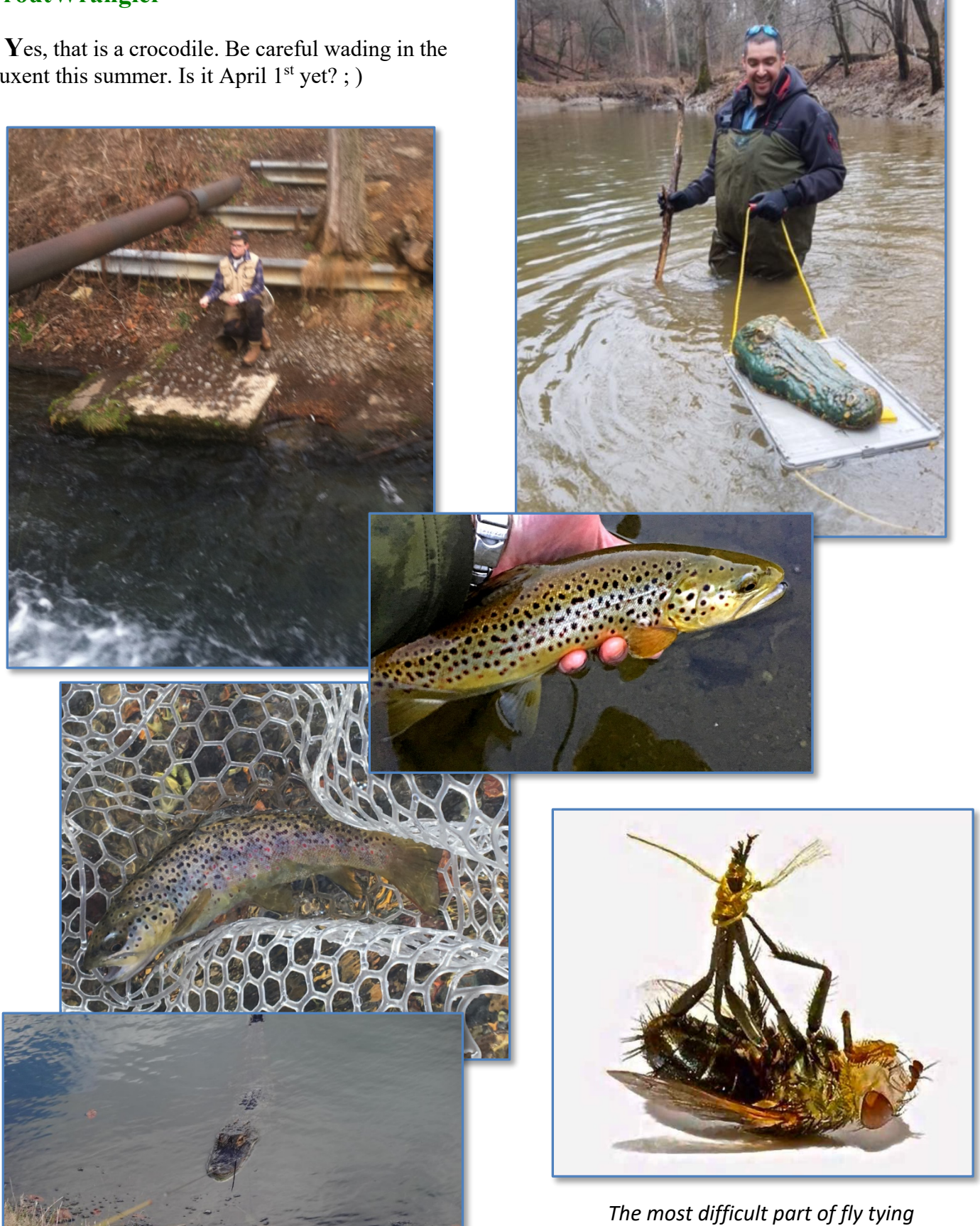
is holding their legs still.

Patuxent this summer. Is it April 1st yet?;)