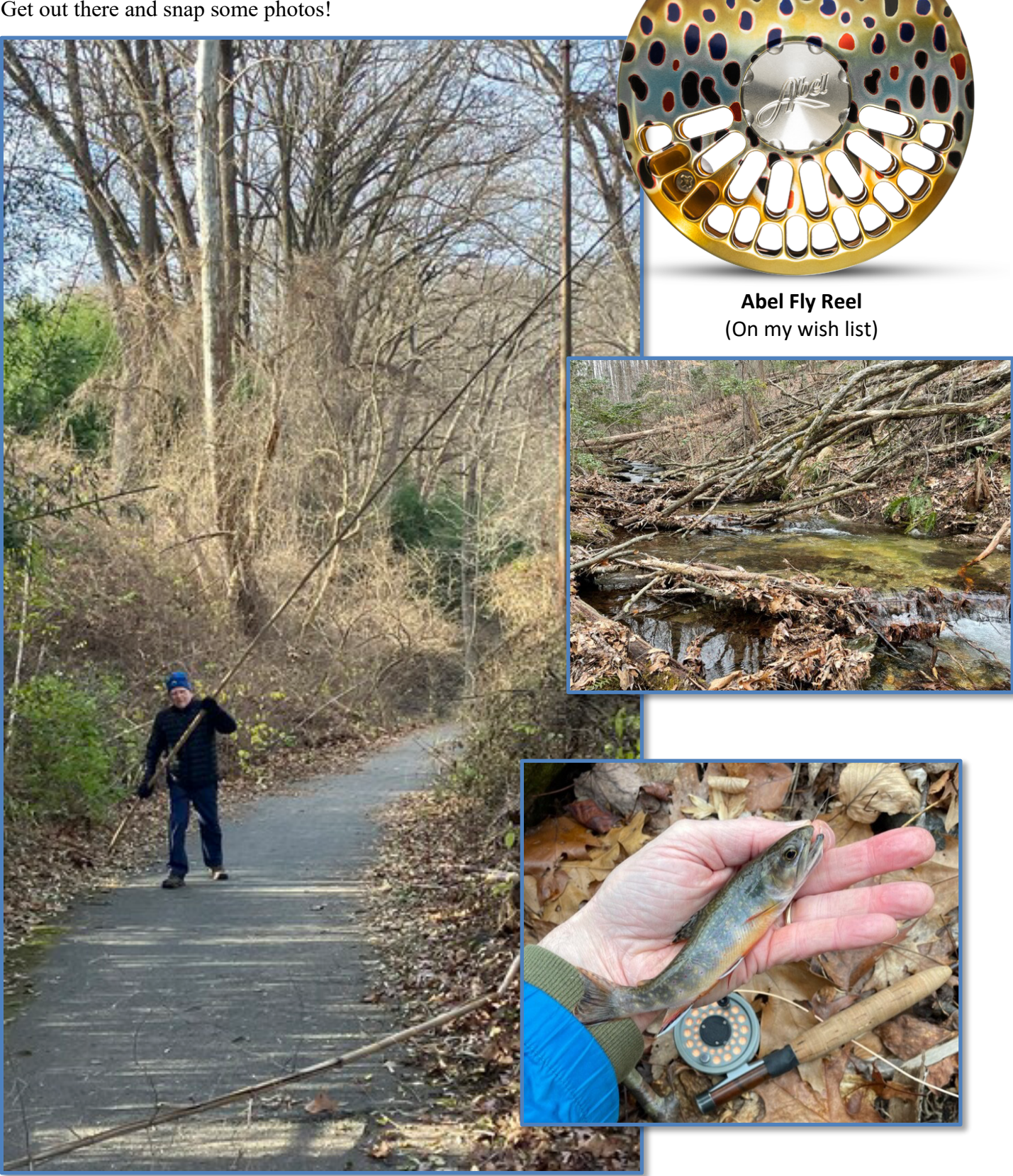
That is one huge Bamboo Rod!

A few fun things popped in from the group this go around. I hope to see more in the coming months. Get out there and snap some photos!