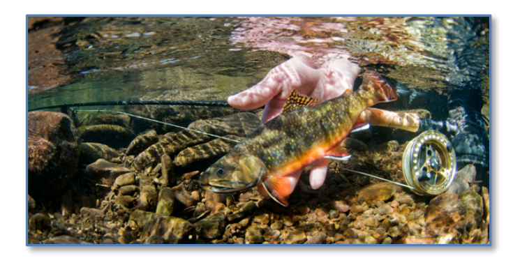
Good fishing in 2018!! Leave a few uneducated trout for me to play with!!

Trout are quick learners. If something got their attention, caused them to be jerked around and handled by some large, hairless ape and released back to the water, they are going to hesitate to attack the same object acting in that manner the next time. The next time you are watching a stream flow past your boots, watch closely how the little patches of bubbles move together down the feeding lanes. At first you may think all the bubbles are marching as a single unit with each remaining in the same relative position to its neighbors. In almost every case, each bubble is moving relative to its nearest neighbors. They may circle each other or one may slow for a moment and then speed up relative to another. Your dry fly has to imitate not only the natural insect floating along, but also its motion relative to other objects on the surface. If your fly is being dragged just slightly faster or slower in the wrong direction than the nearby bubbles, then you have provided a hint to the trout—this may be a fraud.