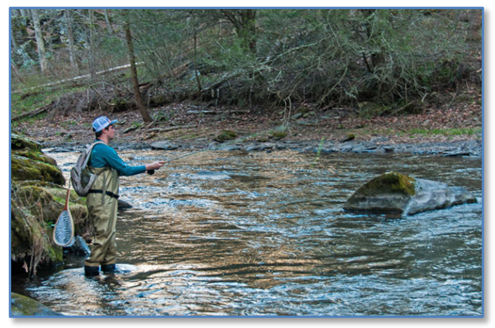
only 15–20 feet long, including the leader. Using the same amount of fly line, I make my next cast about 2 feet to the right or left of the previous. This first series is to cover all the water with the same amount of line, and all presentations are allowed to drift until they run out of line, start dragging, or otherwise are not over likely holding water. Each successive cast in this first series is made 2 feet to the right or left of the previous cast. Special attention is made to get the fly to drift with the foam bubbles or other clearly demarcated lines of drift. Essentially I have divided the typical stream into approximately 2-foot wide

rivers (e.g., Gunpowder, Yough), you have to get out in the middle to just cover some of the water. My first cast is directly upstream from my initial position standing in the stream. This covers the water I will eventually walk through. This very first cast may be